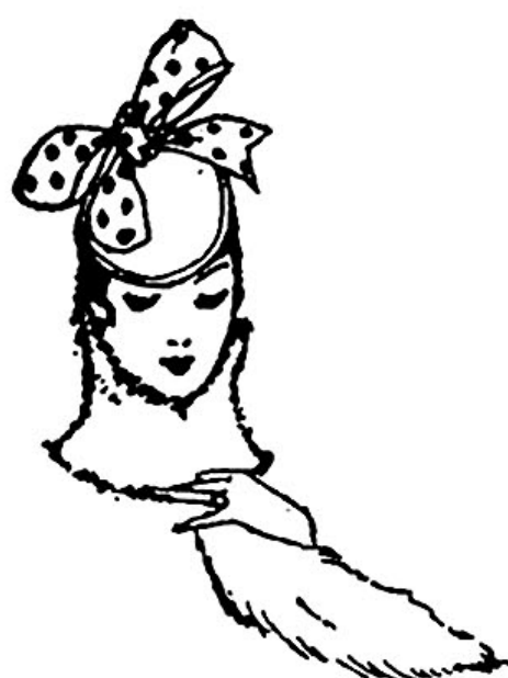
When Summer Zephyrs Grow Boisterous.

As a final word, have you seen the new "Avenue" bags? They are of silk or chiffon or, if you please, they will be made to order to match your gown. They are netted, or, if to go with a tailored suit, it may be they are braid or leather-trimmed. In any case they are intended to look a feature of the costume rather than an afterthought.