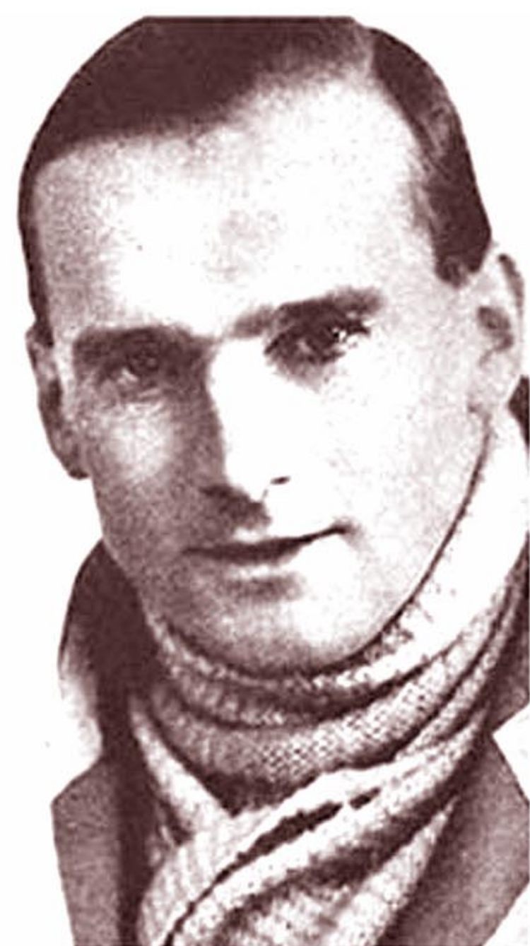
But R. C. Sherriff (above), waiting ten years after the end of the Great War, accurately interpreted the Englishman's code of fighting honor in his Journey's End , which has gone around the world.

it was the curious fact that the supporters of the new regime of freedom were rigidly classic in their dramatic ideals, while the new romanticism was cultivated by the reactionaries. And the romantic mood of the Directory and the Consulship, when opportunity and adventure were bursting through every crevice of society, did not achieve expression on the stage until Hernani was produced in 1830.