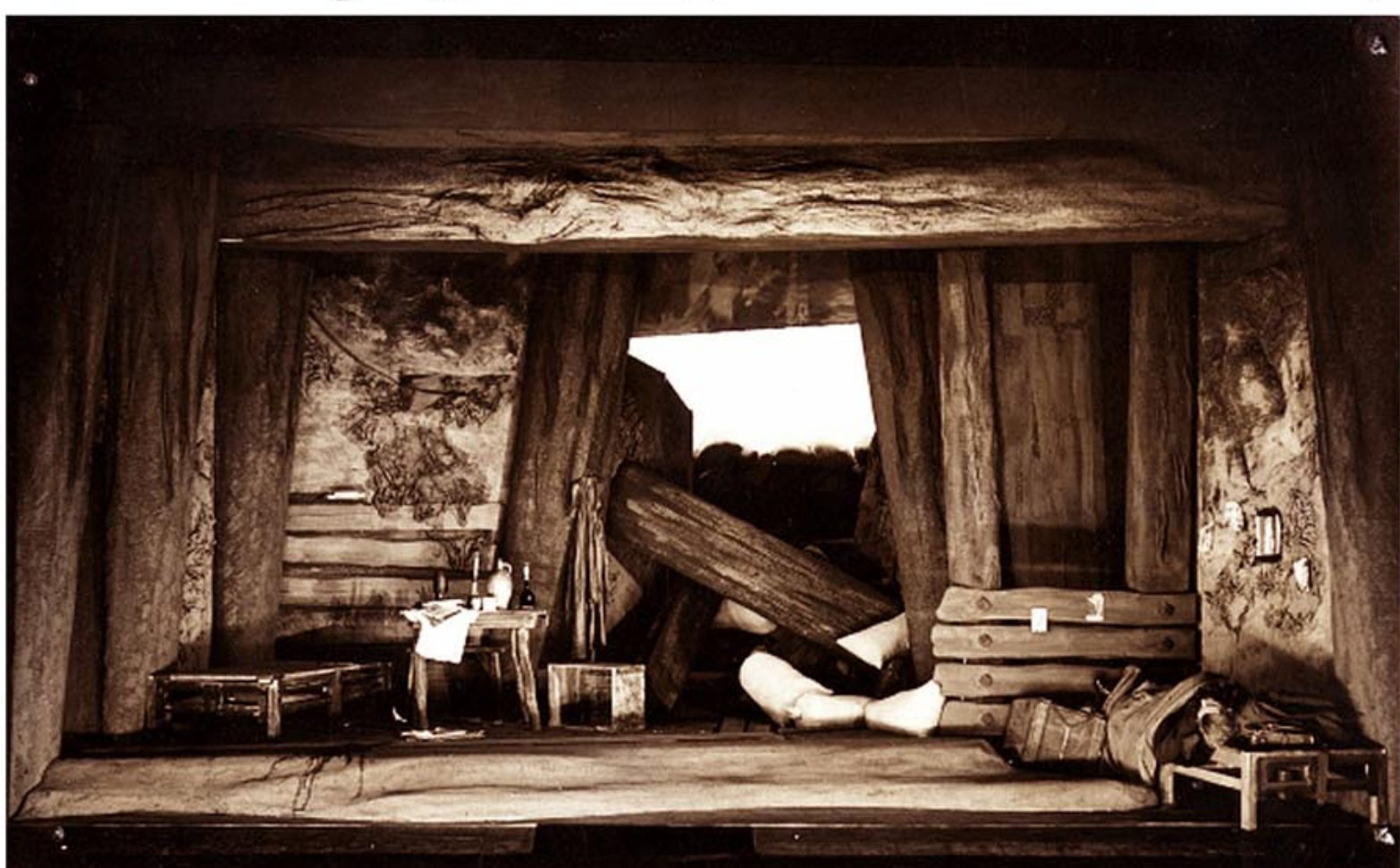
The stage set from a 1930 German production of "Journey's End."

Even the mood of the theatre took long in swinging. During the French Revolution,