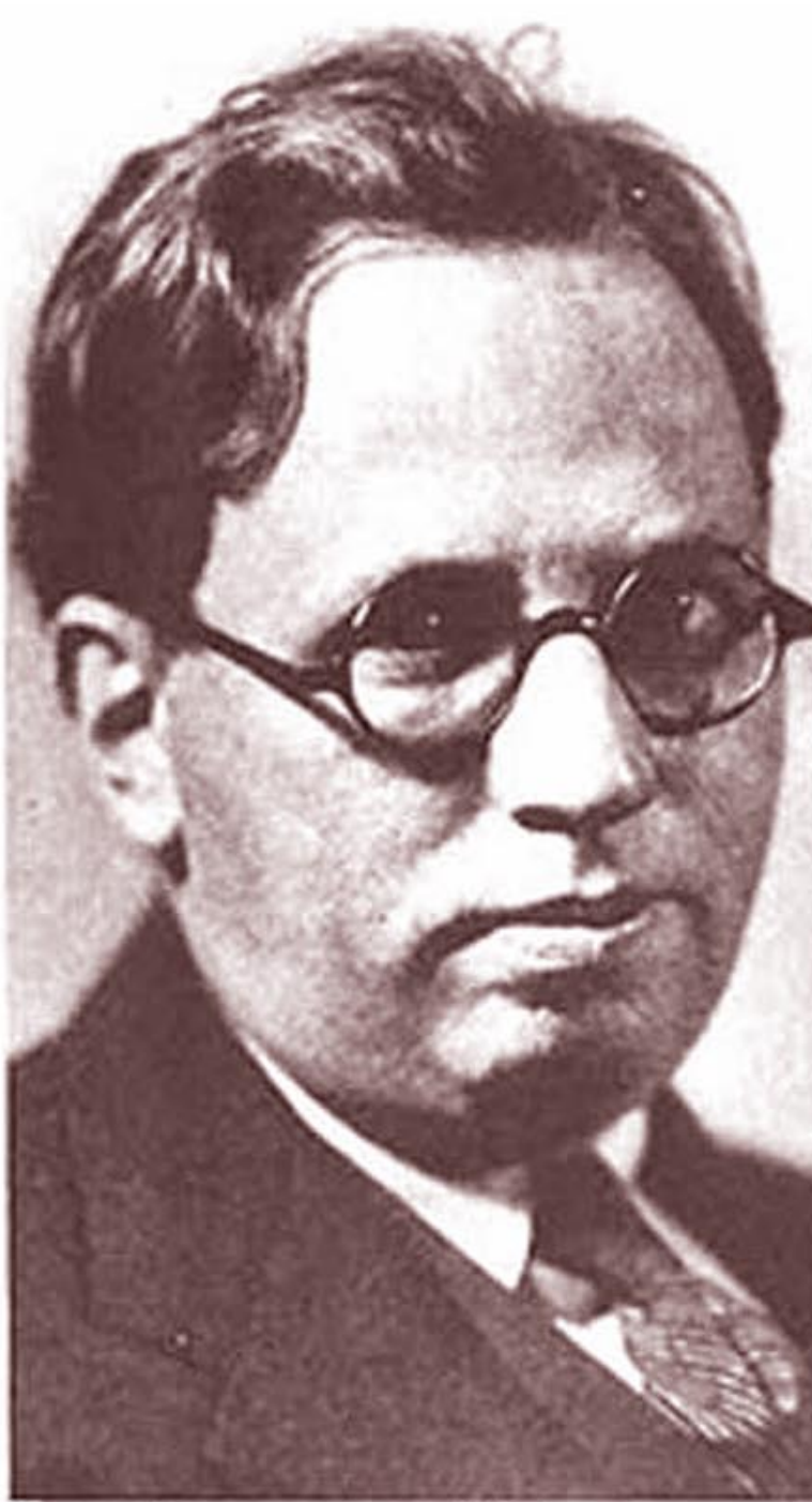
Elmer Rice wrote of the current depression in We, the People . But with all his skill he could not give fresh life to his very dreary picture.

It is clear why, in this instance, a successful play could not be produced immediately after the event. All kinds of censors and excitements prevented both audience and au-