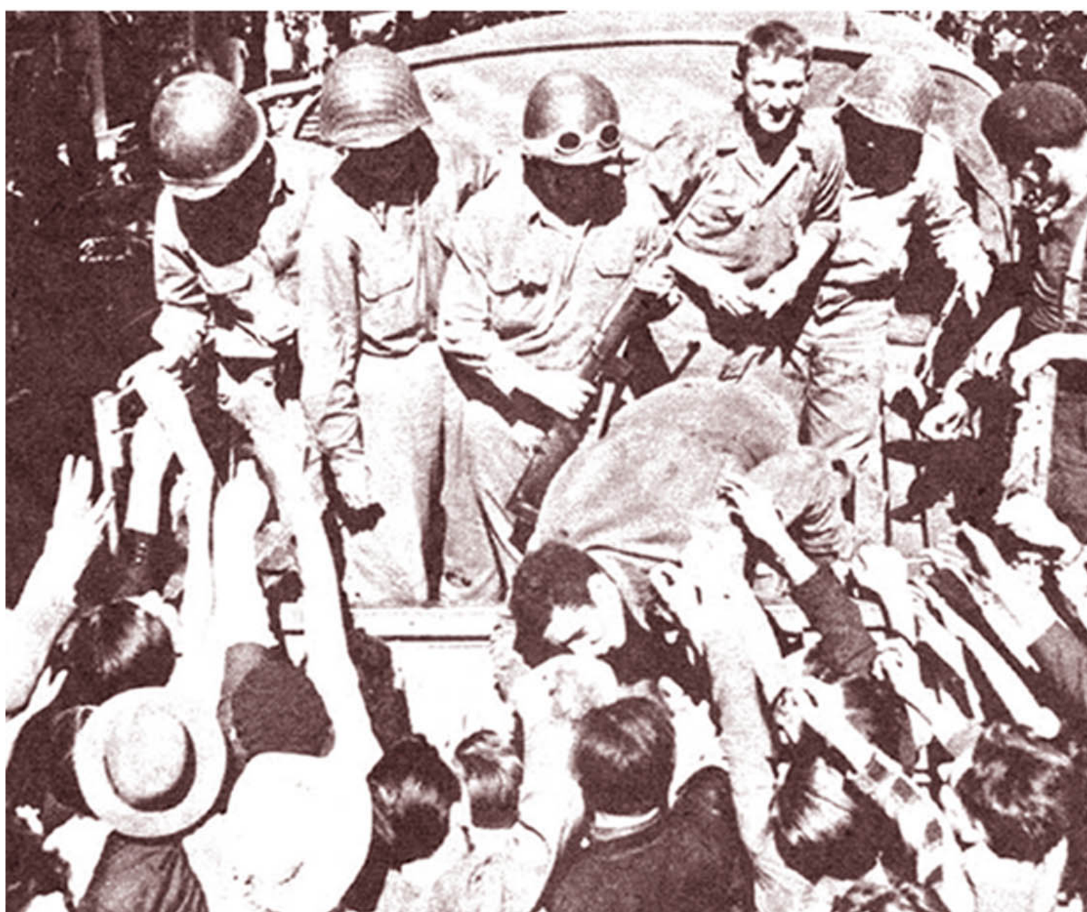
A GROUP OF AMERICAN SOLDIERS WHO WERE WITH THE FRENCH ARMORED DIVISION WHICH ENTERED PARIS ARE GETTING THEIR SHARE OF THE LAVISH GALIC WELCOME. ESPECIALLY THE LAD LEANING OVER THE TAILBOARD.