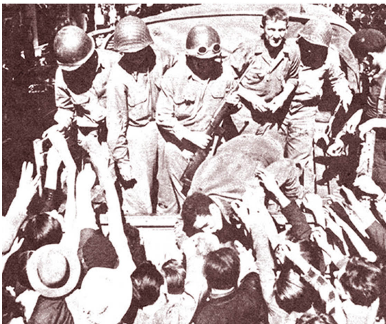
A GROUP OF AMERICAN SOLDIERS WHO WERE WITH THE FRENCH ARMORED DIVISION WHICH ENTERED PARIS ARE GETTING THEIR SHARE OF THE LAVISH GALIC WELCOME. ESPECIALLY THE LAD LEANING OVER THE TAILBOARD.