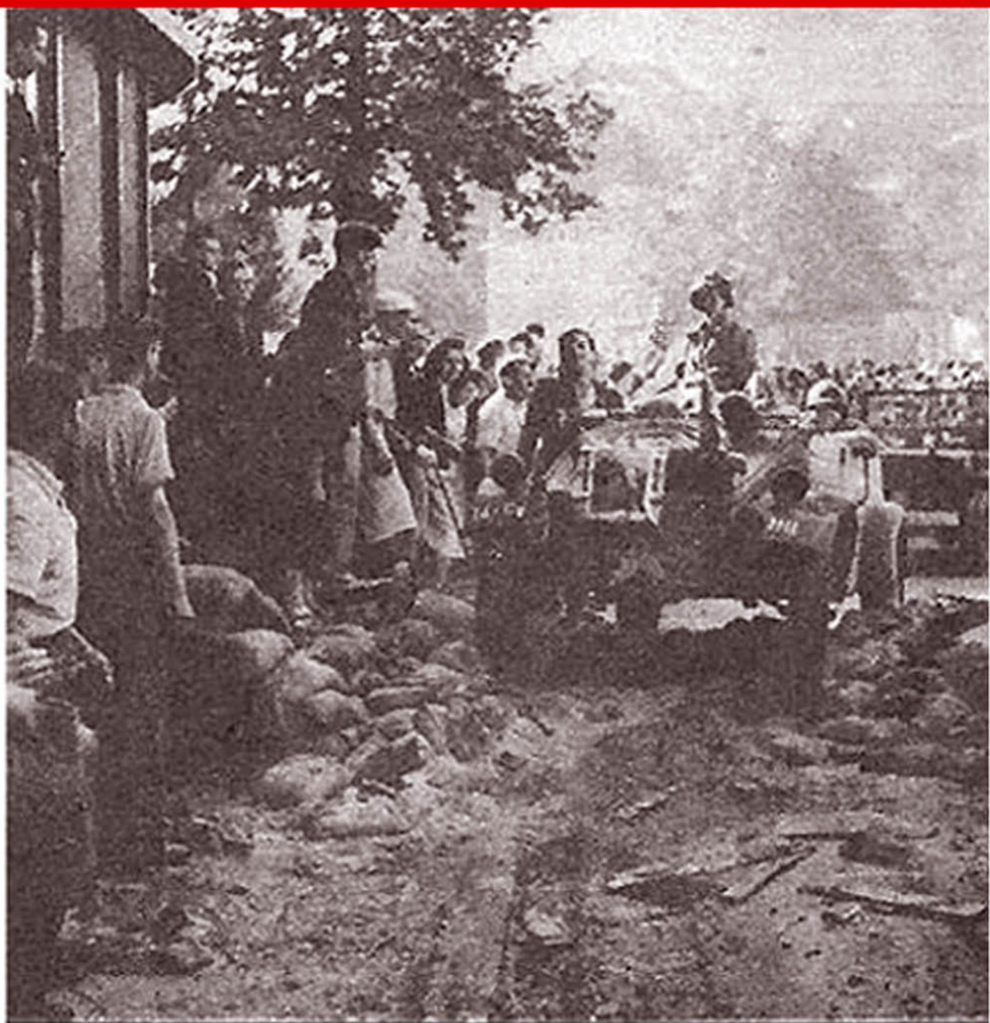
YANK MAGAZINE'S VOLKSWAGEN IS SHOWN CRASHING THROUGH THE FIRST STREET BARRIER IN PARIS BEHIND A TANK OF THE FRENCH ARMORED DIVISION.

The French are old hands at street fighting. They tore up the paving blocks during the French Revolution to build barricades in the streets, and it was no surprise to find them now using the same tactics against the Germans. They had all but immobilized the German forces in a few small areas of the city, and the FFI were in almost complete control before we moved in.