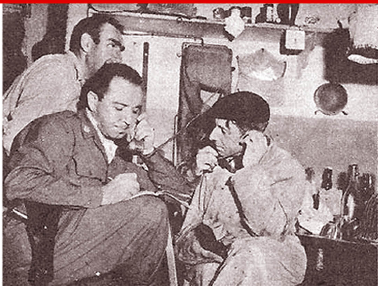
A FRENCH JOURNALIST TALKING TO PARIS BY PHONE FROM THE TOWN OF LONGJUMEAU—BEFORE FRENCH TROOPS ENTERED THE CAPITAL.

morning. So we returned to Antony, where we dropped into a café before trying to catch some sleep.