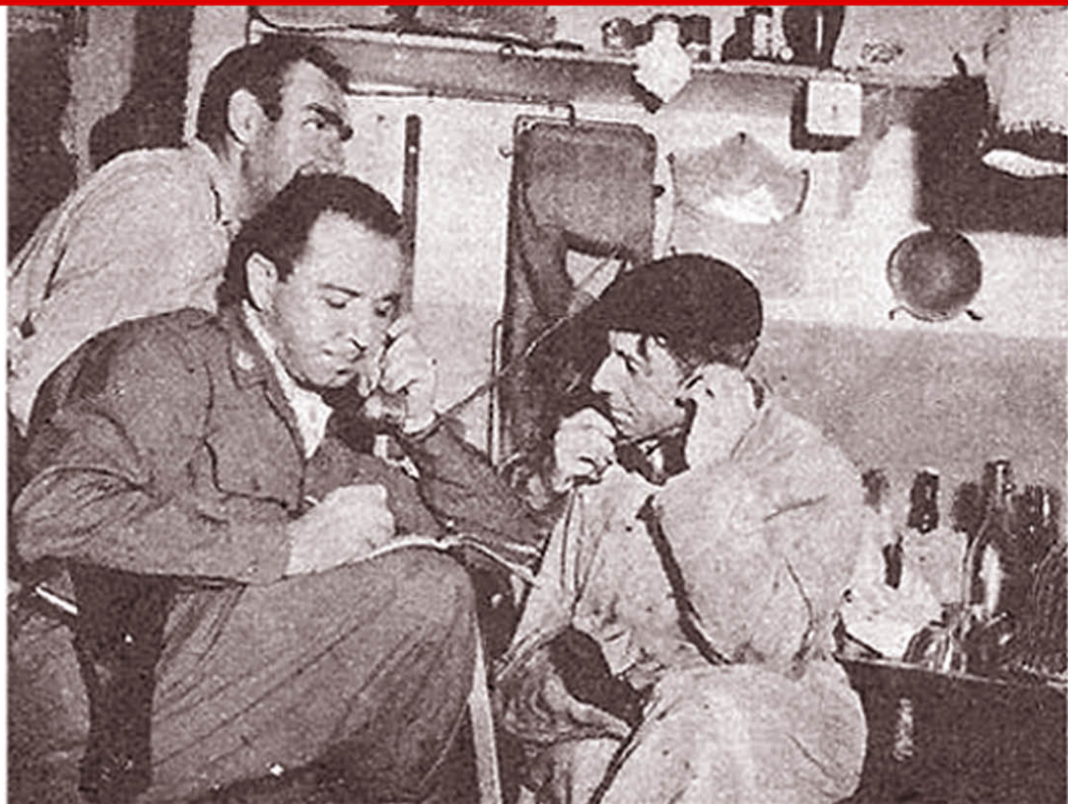
A FRENCH JOURNALIST TALKING TO PARIS BY PHONE FROM THE TOWN OF LONGJUMEAU—BEFORE FRENCH TROOPS ENTERED THE CAPITAL.

morning. So we returned to Antony, where we dropped into a café before trying to catch some sleep.