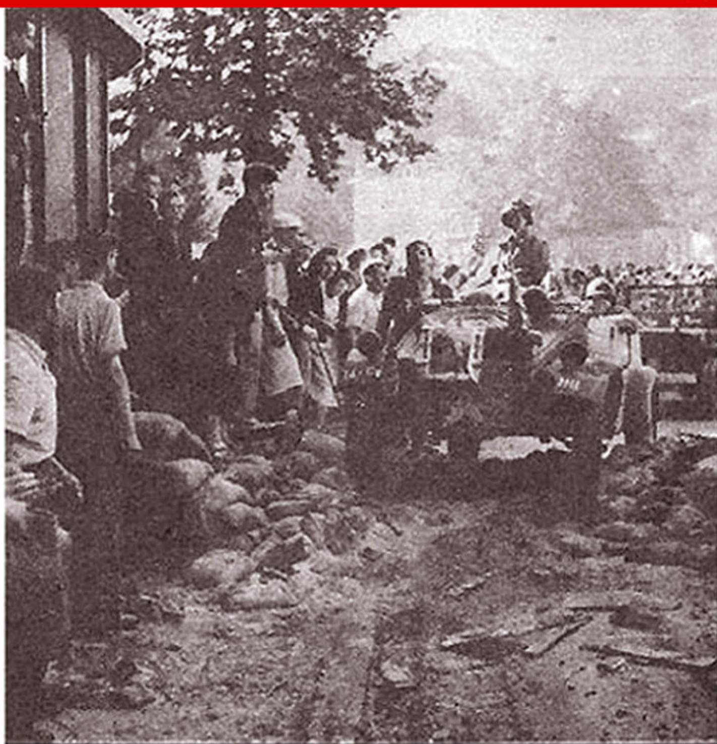
YANK MAGAZINE'S VOLKSWAGEN IS SHOWN CRASHING THROUGH THE FIRST STREET BARRIER IN PARIS BEHIND A TANK OF THE FRENCH ARMORED DIVISION.

The French are old hands at street fighting. They tore up the paving blocks during the French Revolution to build barricades in the streets, and it was no surprise to find them now using the same tactics against the Germans. They had all but immobilized the German forces in a few small areas of the city, and the FFI were in almost complete control before we moved in.