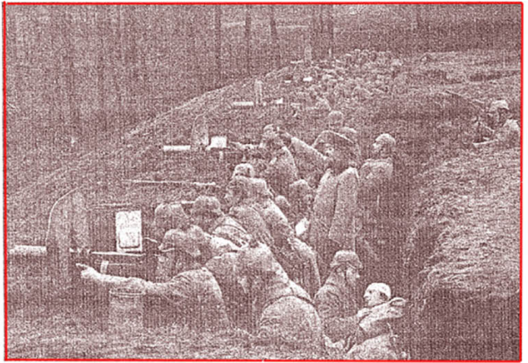
THE ARMORED SHIELD IN MODERN USE BY THE GERMANS.

"The weight of armor is not an objection. 'A very serviceable half-armor weighs about 30 pounds, to which may be added another 15 pounds for clothing and arms, making together 45 pounds. Against this may be placed the (British) service equipment of 1911, totaling 59 pounds 11 ounces. In the case of the cavalry the comparison is still more striking, for the war-horse of the late fifteenth century carried about 350 pounds (horse armor, rider, rider's armor, arms, and saddlery), while the German cuirassier horse of 1909 carried 334 pounds.'