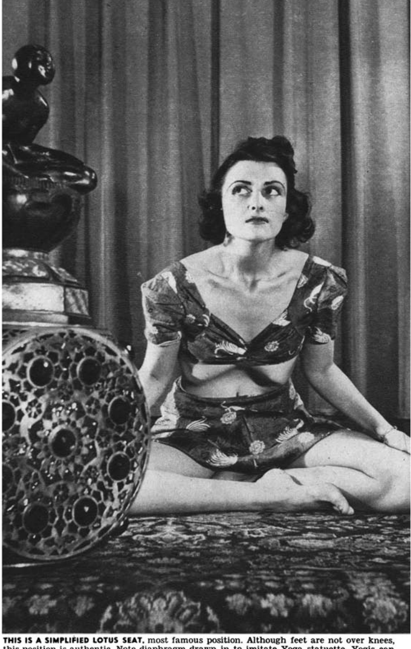
THIS IS A SIMPLIFIED LOTUS SEAT , most famous position. Although feet are not over knees, this position is authentic. Note diaphragm drawn in to imitate Yoga statuette. Yogis can exercise in this position, moving only a few inches, enough to perspire freely. Below, a variation of the Janu-sir-asana or knee-head pose is also the first stage in the head-stand.