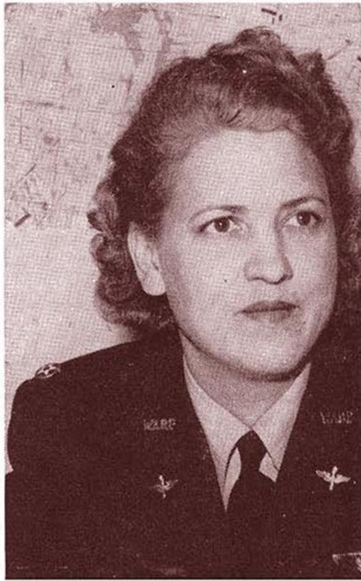
MISS JACQUELINE COCHRAN, Director, Women Pilots Program