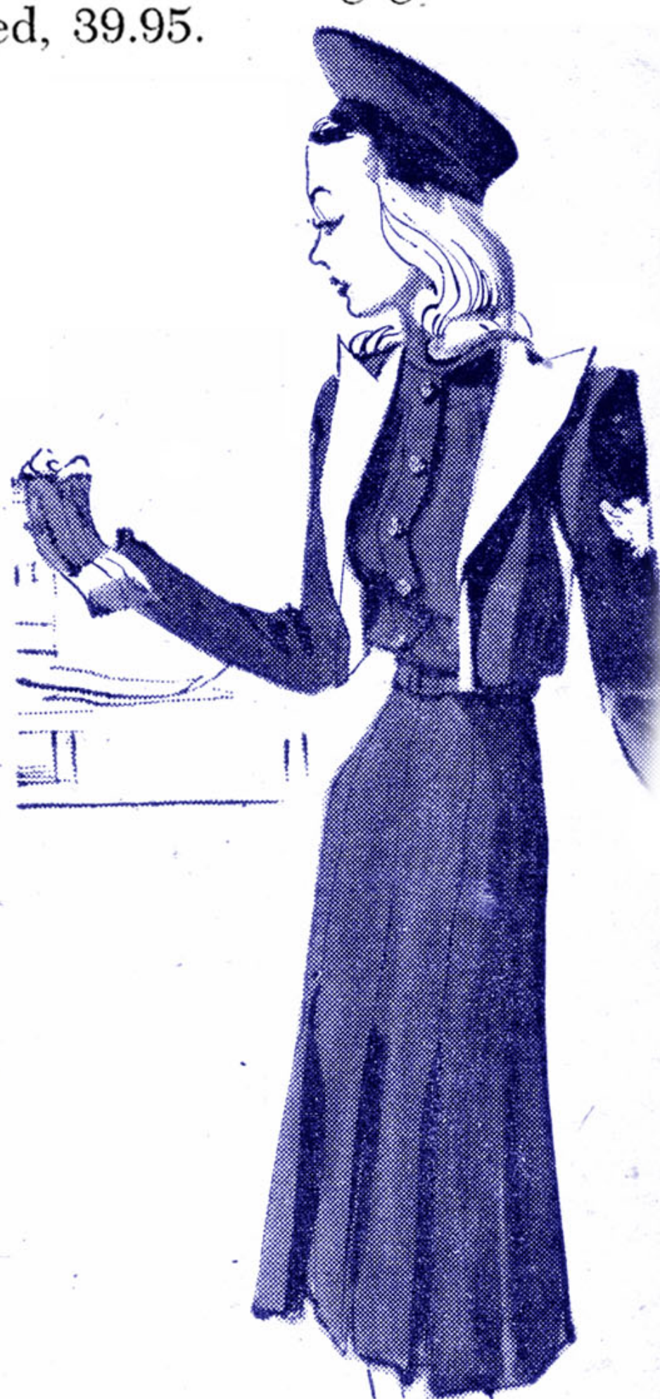
(D) Bloomingdale's, 16.95

In tune with the naval-military trend, as well as the developing fashion for capes, is an officer's cape advertised by Best's, of wool flannel with velvet collar and gold braid trim, for North or South, and "right" over suits or evening gowns. Lined in blue or red, 39.95.