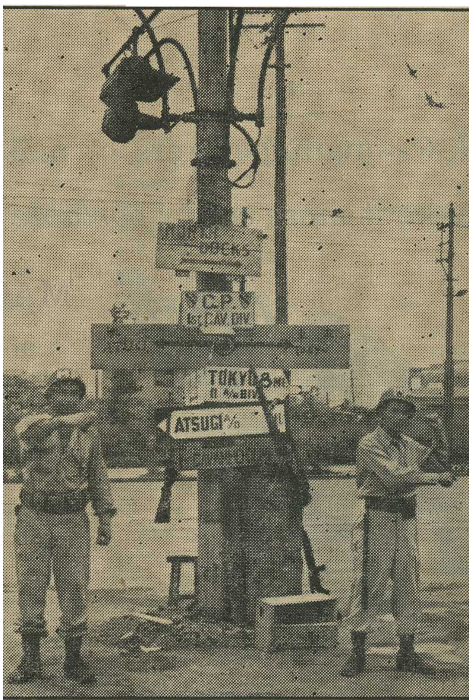
MP's hang their guns on a Yokohama signpost and wave the soldiers in