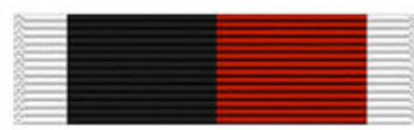
The U.S. Army Occupation Campaign Ribbon

Reading English-language newspapers, the average soldier is getting a kick out of the number of ranking Jap generals killing or trying to kill themselves. In Tojo's case, the feeling was that this top war criminal does not deserve the easy way out. So far as most others are concerned it makes