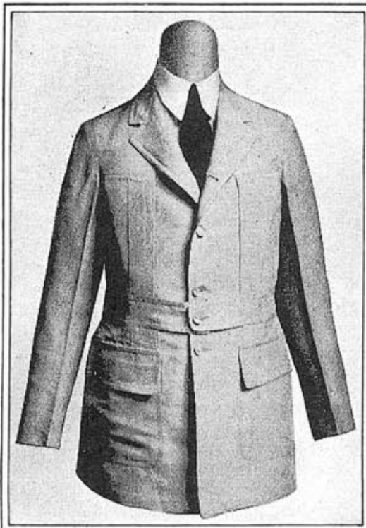
Norfolk Riding Coat of Shantung silk, $18