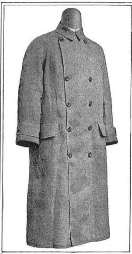
A light weight, crash motor coat; dust color, dust proof and durable, $8