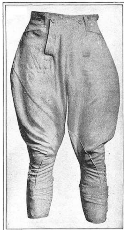
These gabardine riding trousers are light, cool, and may be readily cleaned, $16