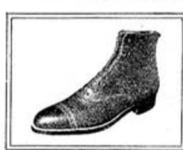
The shoe at the top is an English grain walking boot, $10. The riding boot is of black or tan Russia calf, $22