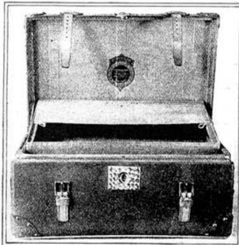
Leather trunk of convenient size, cloth lined, $44