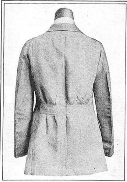
Back view, Chester Jacket of Shantung silk, $18

On page 114 I have shown a riding boot which is rapidly supplanting the puttee. The riding boot is more comfortable, easier to put on, and more complete than the puttee, as it takes the place of the shoe. The boot is worn in either tan or black, and in (Continued on page 2)