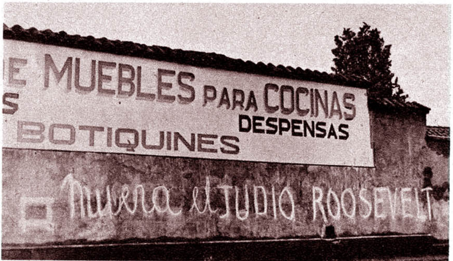
SANTIAGO WALL SIGN: "DEATH FOR THE JEW ROOSEVELT"