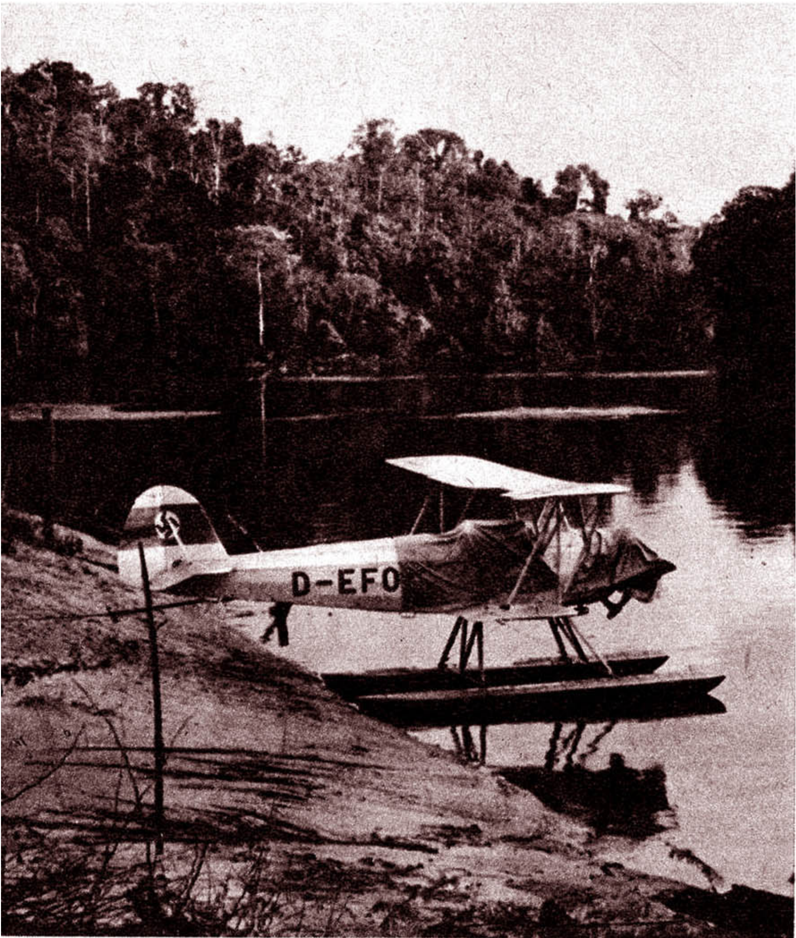
A Nazi hydroplane (note swastika) in the Brazilian jungle, not far from where both Ecuador and Bolivia border on Brazil.