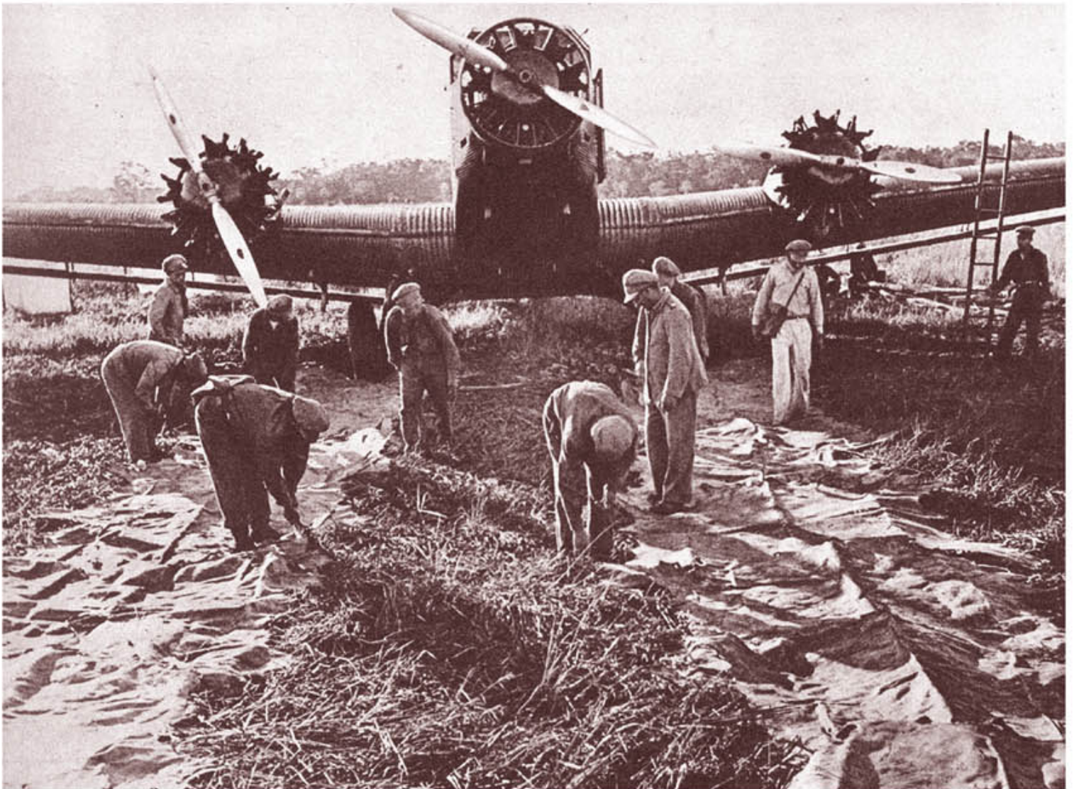
NAZIS EXPERIMENT IN BOLIVIA WITH COWHIDE RUNWAYS FOR A GERMAN JUNKER J52 ON GRASSY TERRAIN. THE PLANE IS WITHIN BOMBING RANGE OF PANAMA CANAL