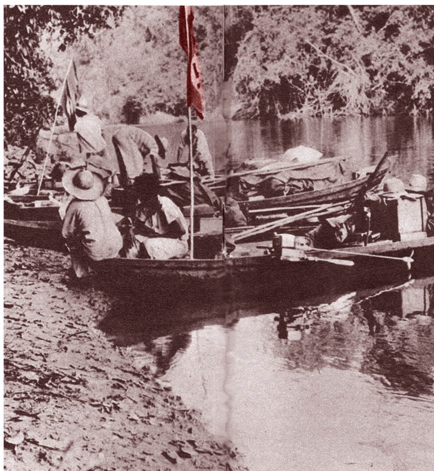
GERMAN "tourists" cruise the Amazon and make notes — on jungle life. Even on pleasure row boats they hoist the swastika flag.