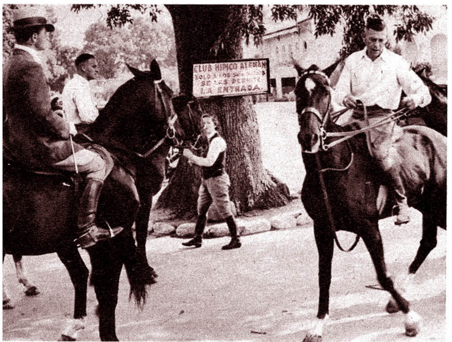
The German Horsemen's Club (for members only) in Mexico City. Cavalry isn't obsolete in modern warfare.