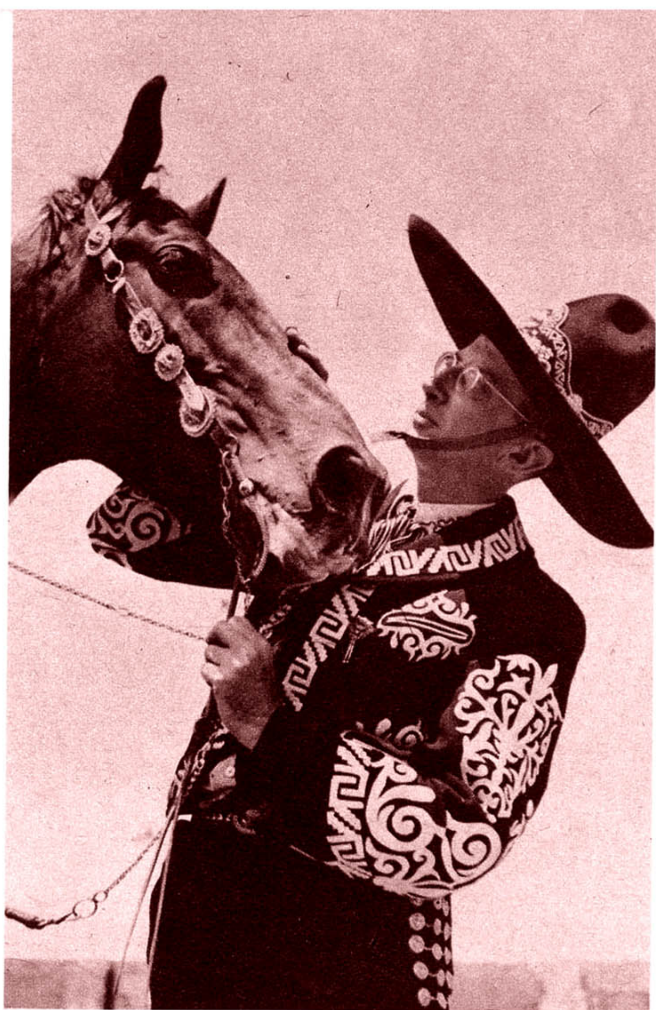
Some Nazis pretend to be natives but remain German. Here's one dressed as a Mexican horseman.