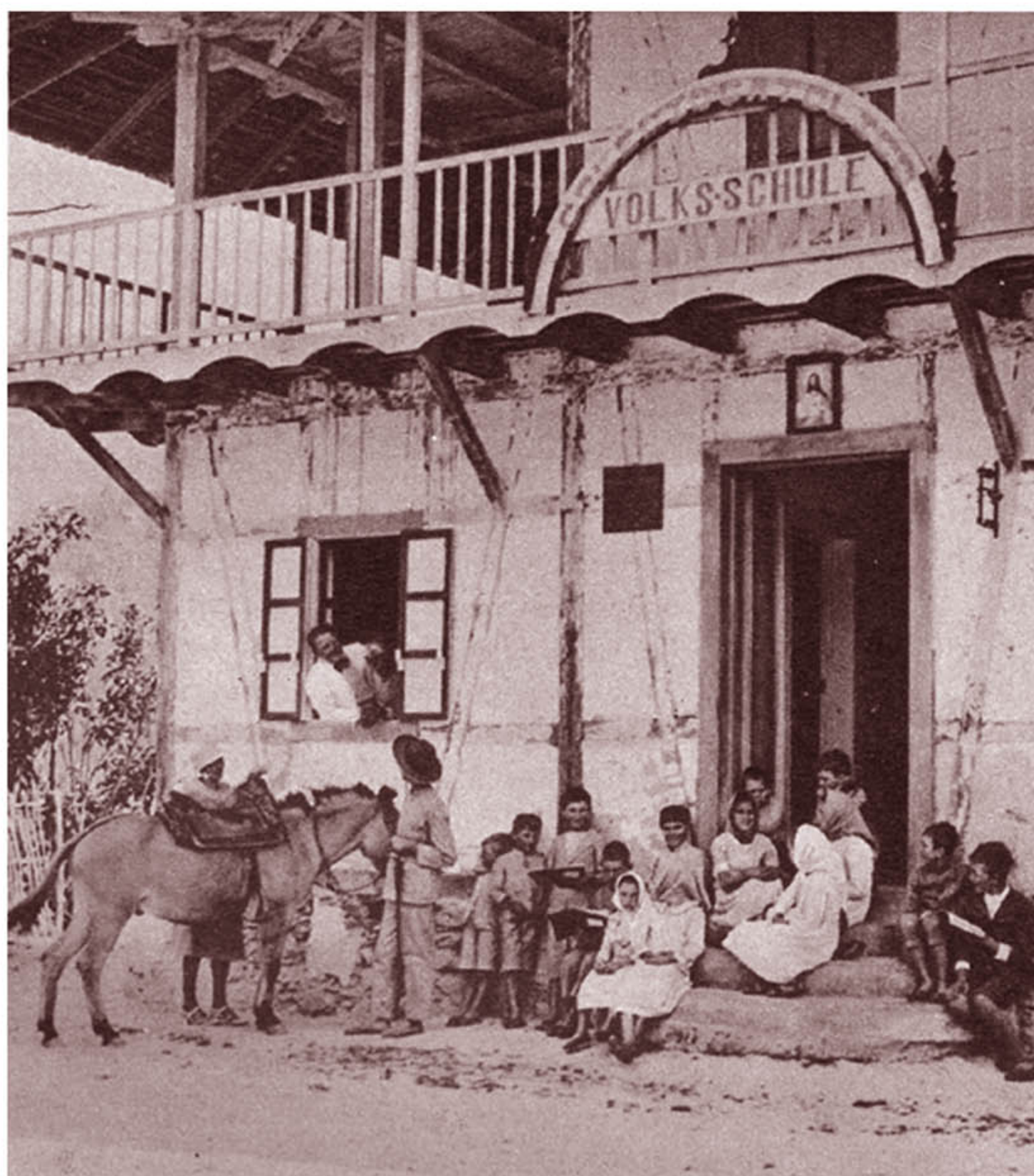
German elementary school at Tovar, Venezuela. Paradoxical with Nazi attitude toward church is the picture of Christ above the door.