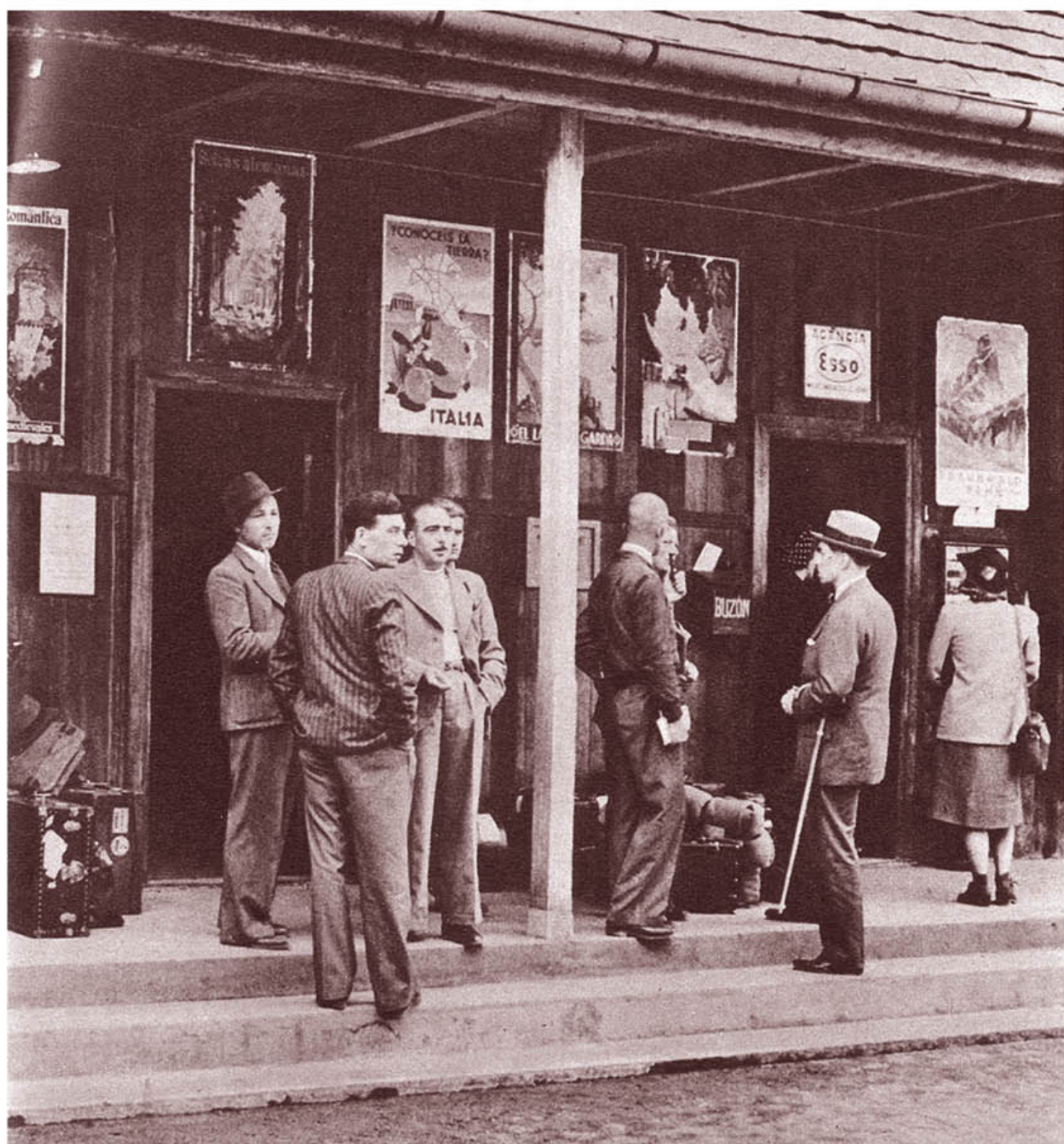
YOUNG GERMANS AT A CHILEAN RAILROAD STATION. THEIR COUNTRY IS AT WAR—WHY AREN'T THEY? NOTE POSTERS