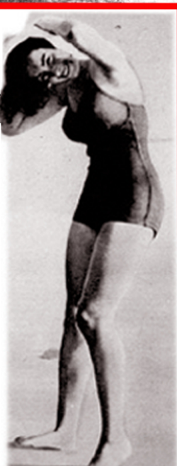
U. S. A.'s BEST FIGURE LIKE SURFBOARDING

For surf-riding is more than an hour's frolic. It's a whole week-end, camping with your surf-board making your tent walls. Keynote is yelling "Outside" when a giant breaker is rolling in.